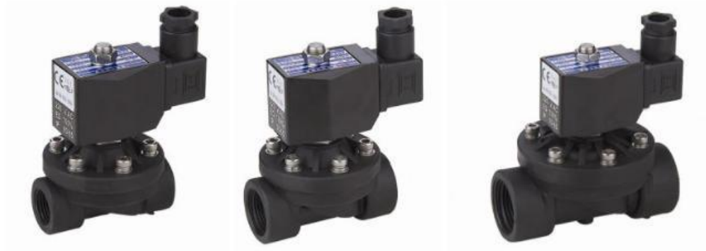
2 way NPT 3/4" IP 65 water Plastic solenoid valve

Valves available in normally closed and normally open constructions. Available in either AC or DC operated with plastic bodies/ stainless steel tube/ soft magnetic alloy core. Therefore the price is lower compared with that of brass and stainless steel.